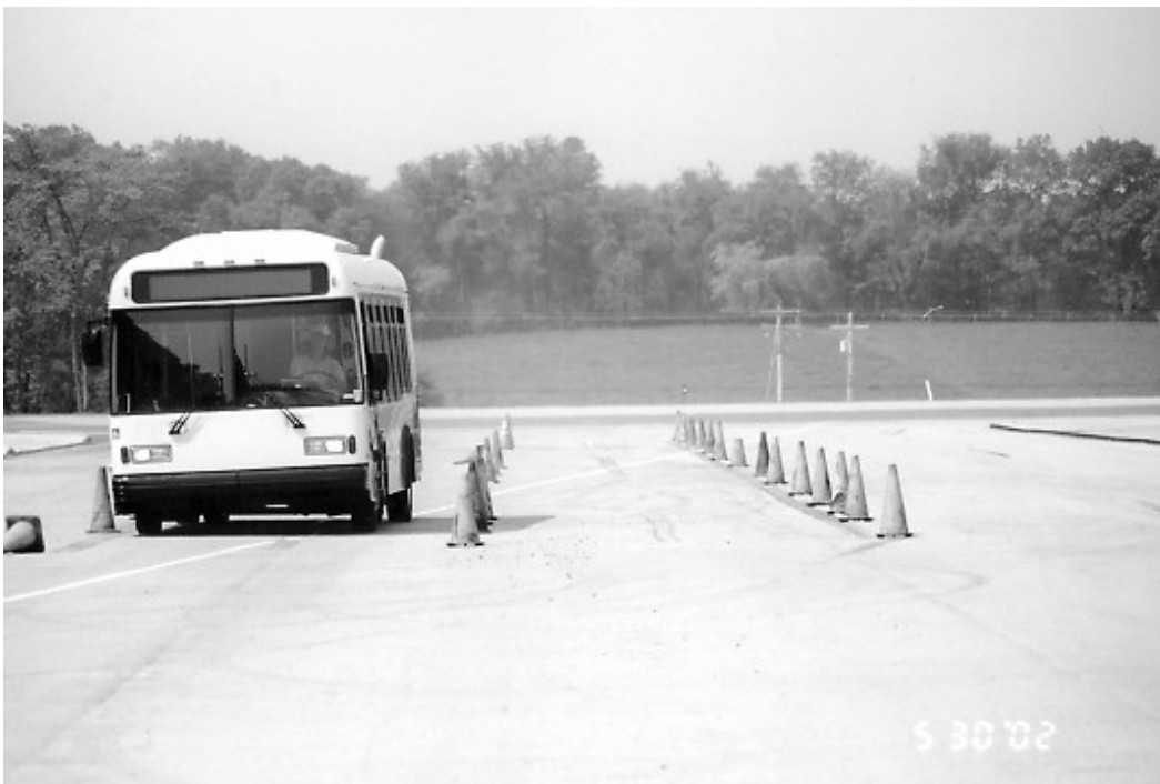
RIGHT - HAND APPROACH