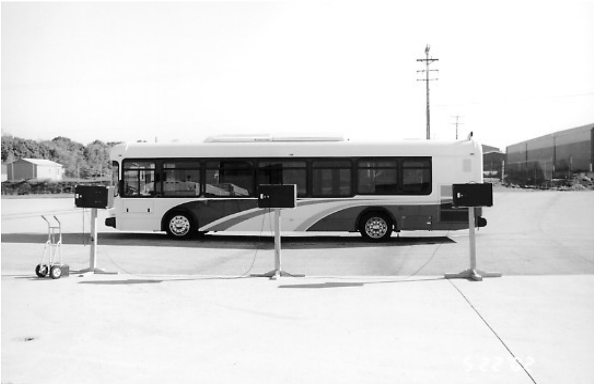
TEST BUS SET-UP FOR CONDITION #1 INTERIOR NOISE TEST