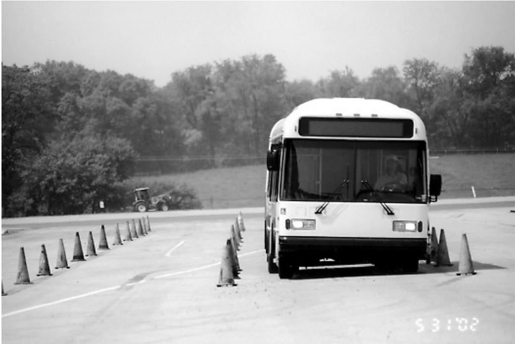
LEFT - HAND APPROACH