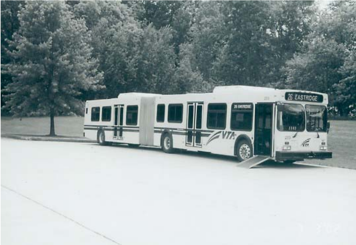
NEW FLYER INDUSTRIES, LTD. MODEL D60LF