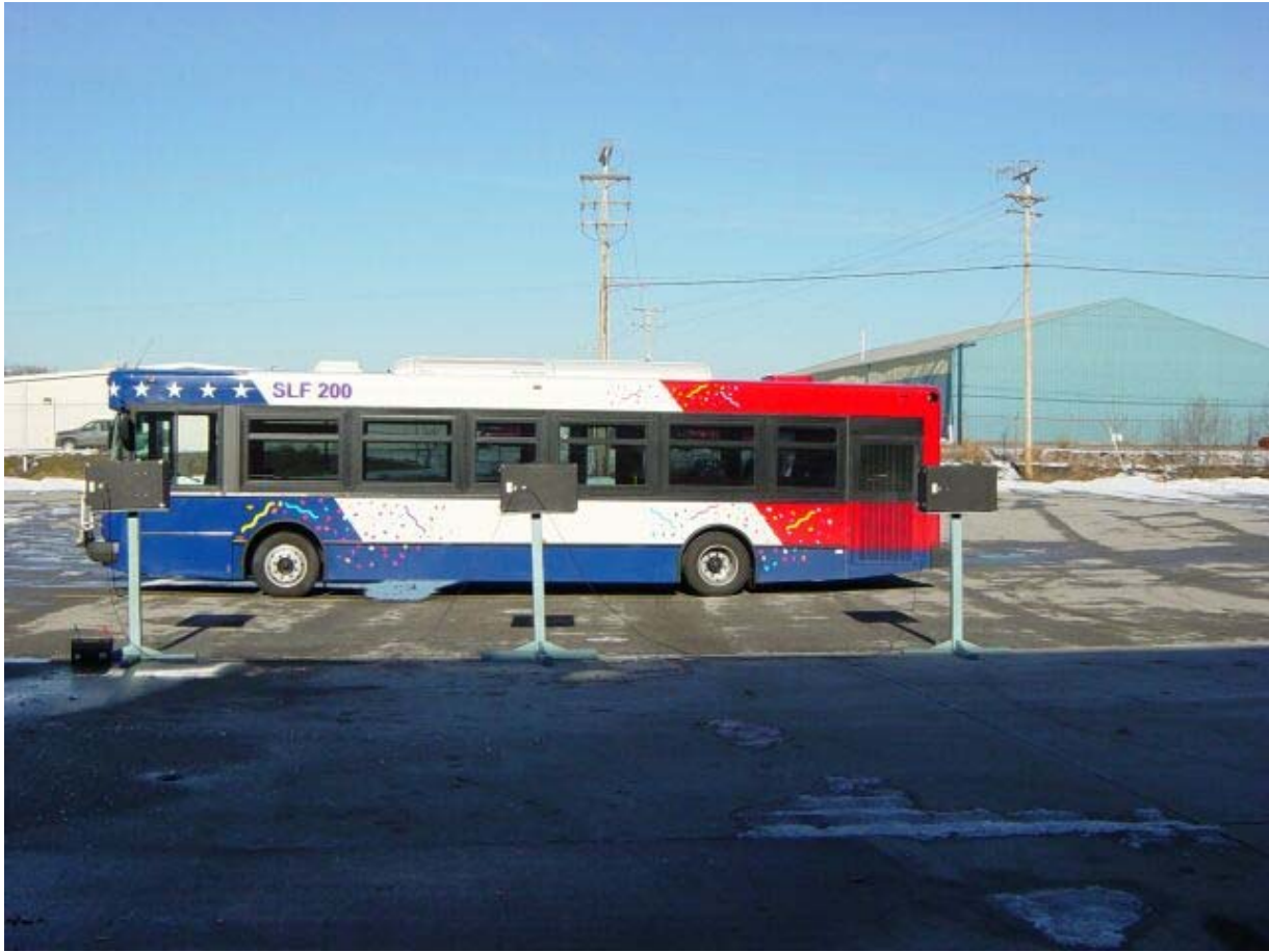
TEST BUS SET-UP FOR 80 dB(A) INTERIOR NOISE TEST