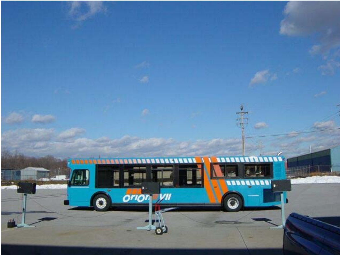
TEST BUS SET-UP FOR 80 dB(A) INTERIOR NOISE TEST