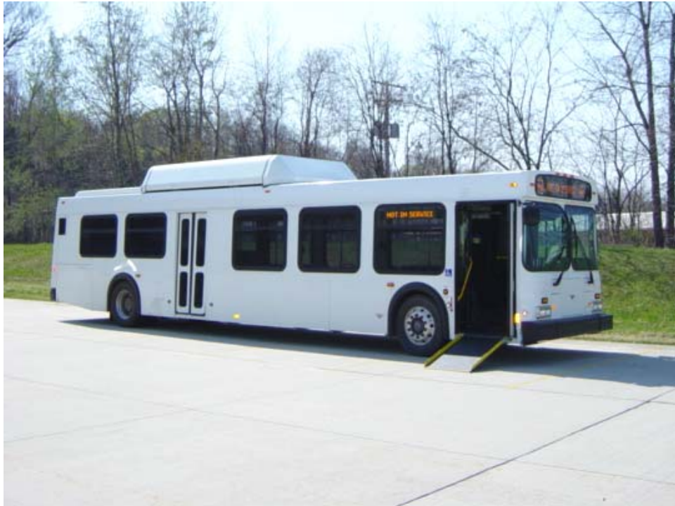
NEW FLYER OF AMERICA MODEL DE40LF