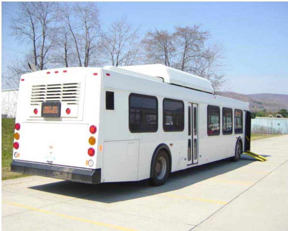
MODEL DE40LF EQUIPPED WITH A NEW FLYER MODEL PLN145654 FOLD-OUT HANDICAP RAMP