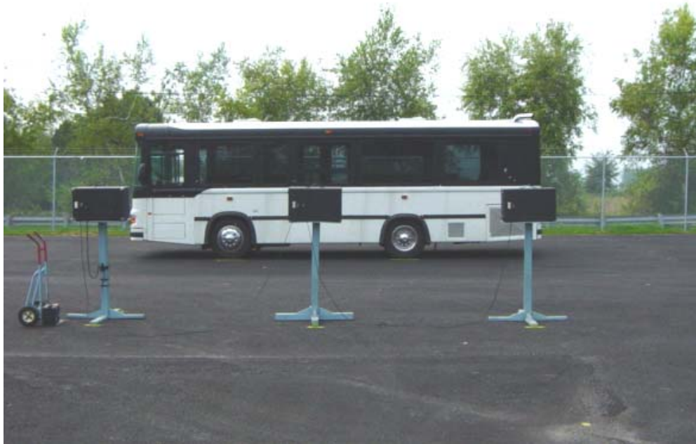
TEST BUS SET-UP FOR 80 dB(A) INTERIOR NOISE TEST