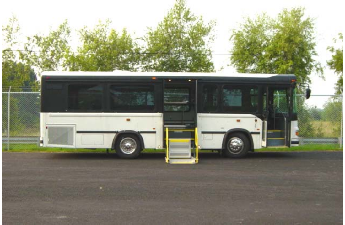
BLUE BIRD BODY COMPANY MODEL XCEL 102 EQUIPPED WITH A RICON MODEL F9T-SG002 HANDICAP LIFT