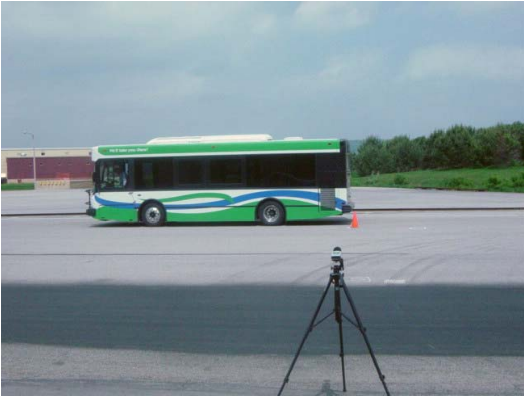
TEST BUS UNDERGOING EXTERIOR NOISE TESTING