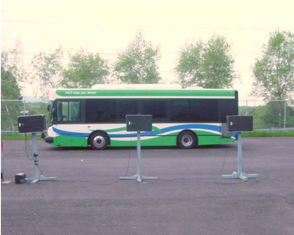
TEST BUS SET-UP FOR 80 dB(A) INTERIOR NOISE TEST